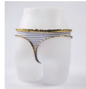
Maximilien Ramoul - Culotte de chasteté