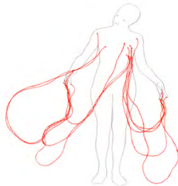
Pauline Cornu - Veines