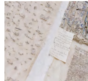
Dolores Gossye - Eforce